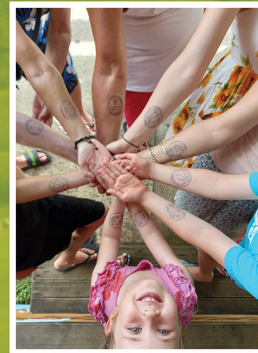
Tattoo time in Raro