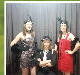
Just another dress up