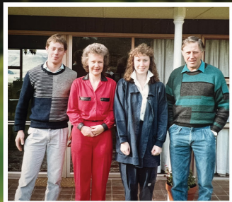
Rocking the 80's