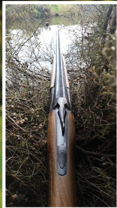
Annual dusting off of the shotgun