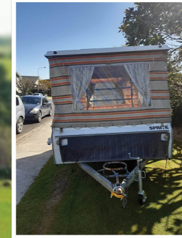
Poppy the Poptop