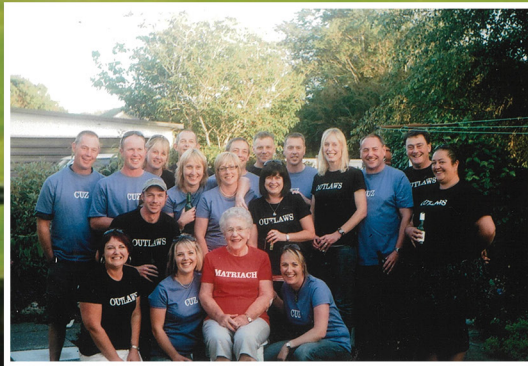
Cuzzies Night Out