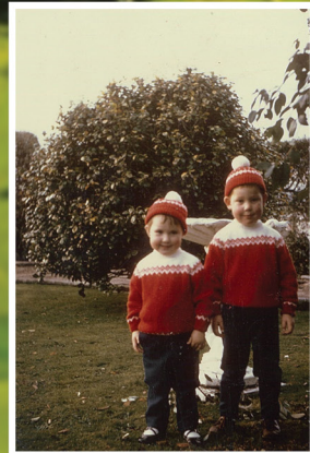
Oh so matchy matchy