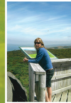
Walk up Moores Reserve